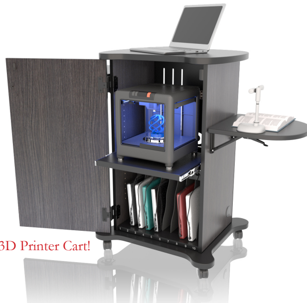
3D Printer Cart!