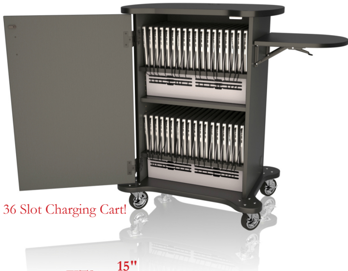
36 Slot Charging Cart!

Our compact, feature rich multi-maker cart has a small footprint with a big impact. The Multi-Maker cart can be used as a presentation cart, a great addition to your makerspace room, or a charging and storage solution for a classroom or media center. Let us help you organize so you can teach and make!