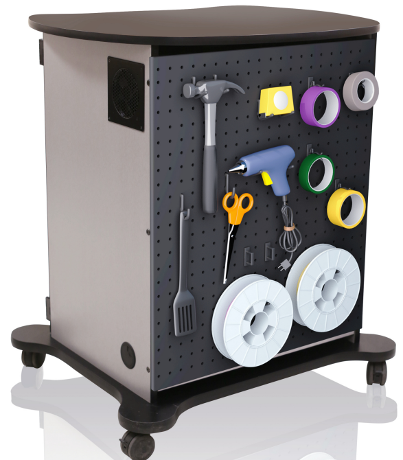
(Shown in Grey Nebula Finish)

Storage Bins Adjustable Shelf Side Folding Shelf 5" Heavy Duty Casters