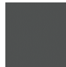
Standard Pewter Finish