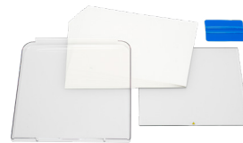
Advanced 3D printing kit Add a front enclosure, extra build plate and adhesion sheets